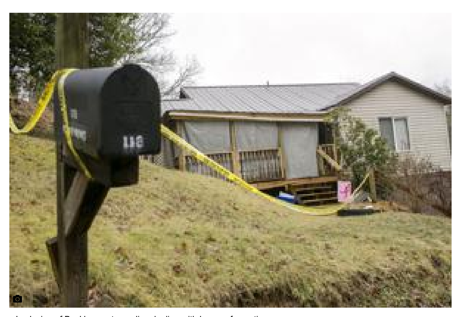
In slaying of Beckley pastor, police dealing with layers of questions