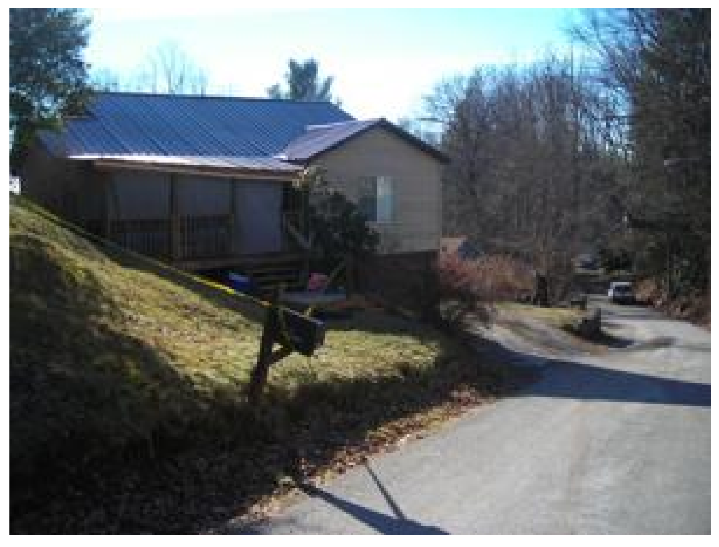
SECOND UPDATE: Local pastor killed in Beckley home; suspect charged