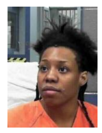
Suspect in pastor's killing waives time for prelim