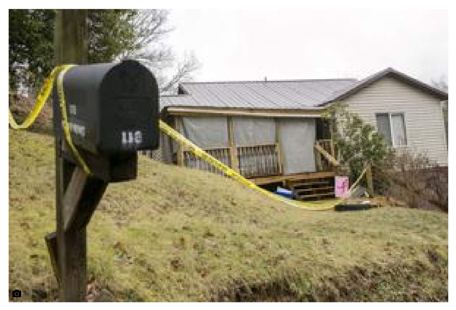
Browne preliminary hearing postponed